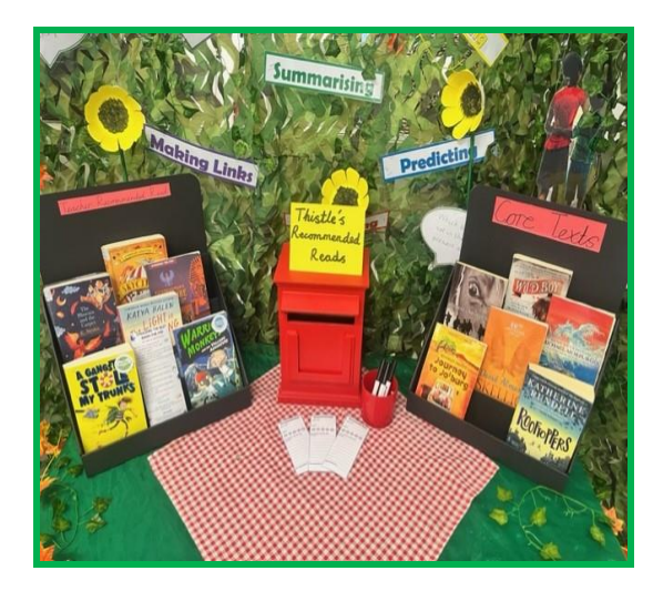
Wider Curriculum Displays