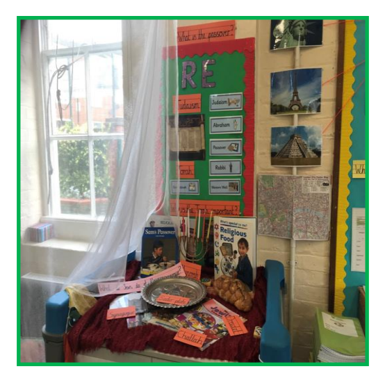
Book Corners (EYFS and KS1)